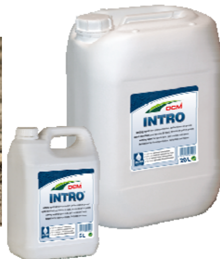
with DCM INTRO ®